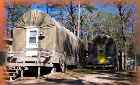
Covered Wagon Dorms