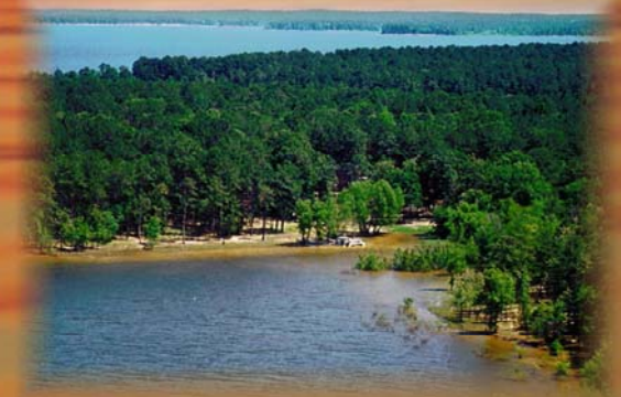
Lake Sam Rayburn and Angelina National Forest

Starting @ $30 a person for one night and three meals